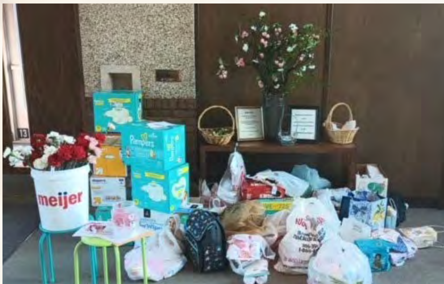
The photo above is from Our Lady of La Salette’s Baby Bud Tree program for Operation Layette.